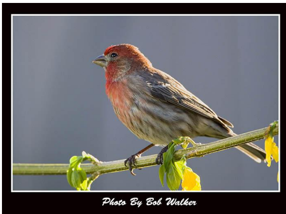
AND THE RESULTING BEAUTIFUL CAPTURE